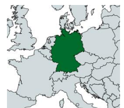
Figure 3 Created with MapChart.net

While some countries have adopted their legal framework quickly, others have been slower to implement e-prescriptions. One of the countries which is expected to finalise the implementation phase is Germany. A pilot project has been running there since July 2021. The new German government plans to accelerate the mandatory nationwide introduction of e-prescriptions as mentioned in the new coalition agreement signed in December 2021. The e-prescription is thus still in its test phase as the government cancelled the initially foreseen start date of 1 January 2022. Certain quality criteria need to be fulfilled before the nationwide roll-out can begin.